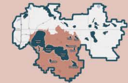
Forest Lake Management District