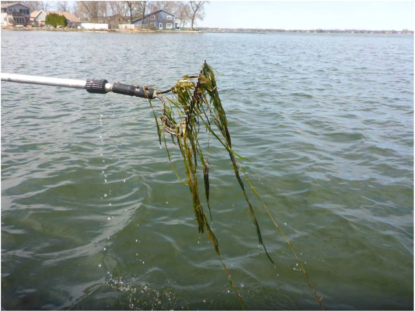
Curlyleaf Pondweed Sampled in Forest Lake, April 23, 2025