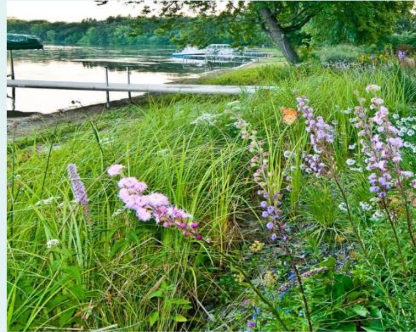
Shoreline vegetated with deep rooted native plants.

Visit www.clflwd.org for more information