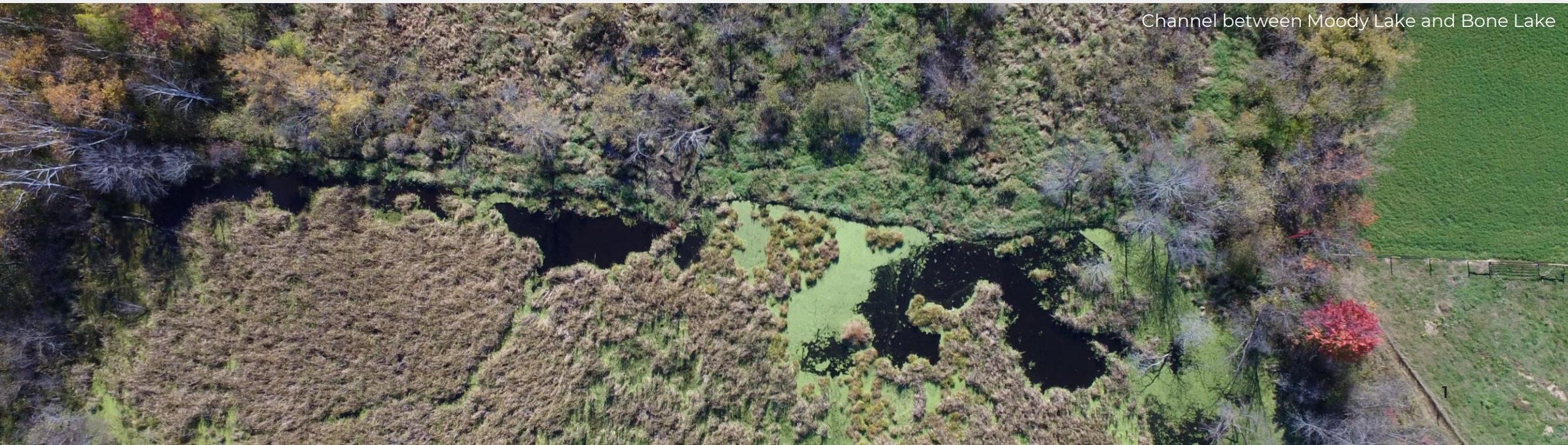
Channel between Moody Lake and Bone Lake