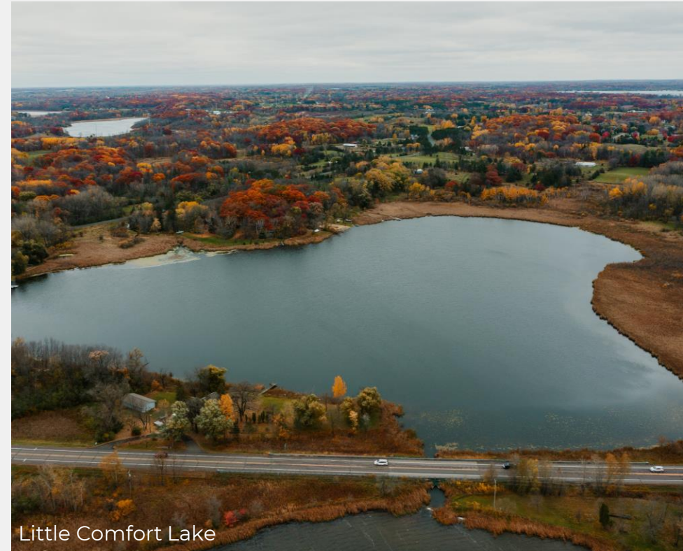
Little Comfort Lake