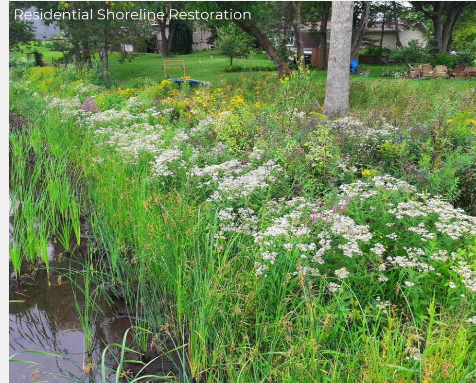
Residential Shoreline Restoration