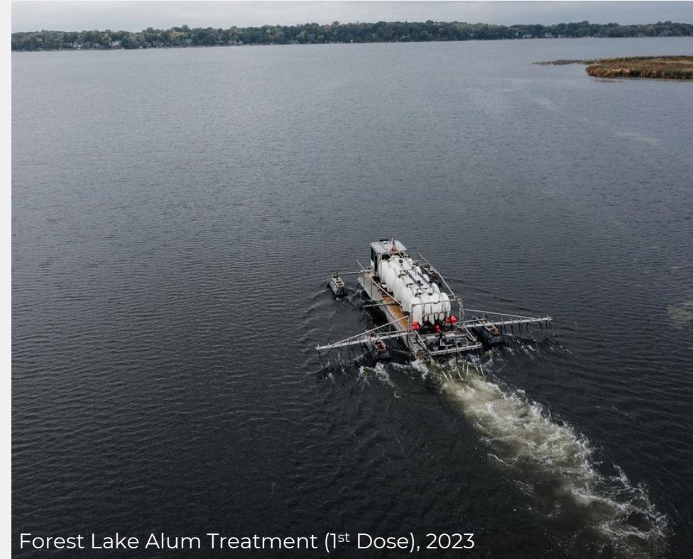
Forest Lake Alum Treatment (1 st Dose), 2023