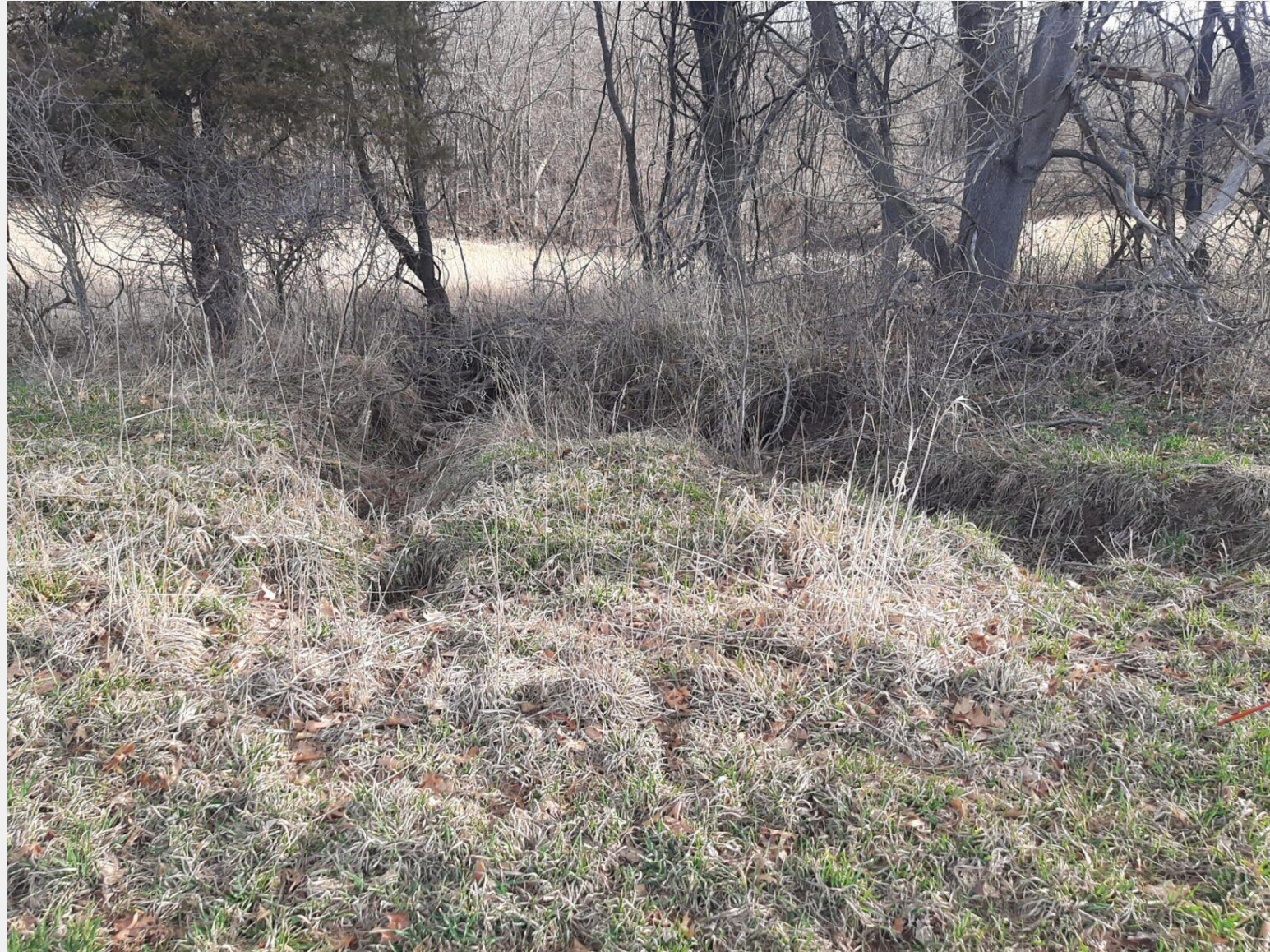
2024 site visit: Field edge gully erosion – Nielsen Lake (Olson Farm)