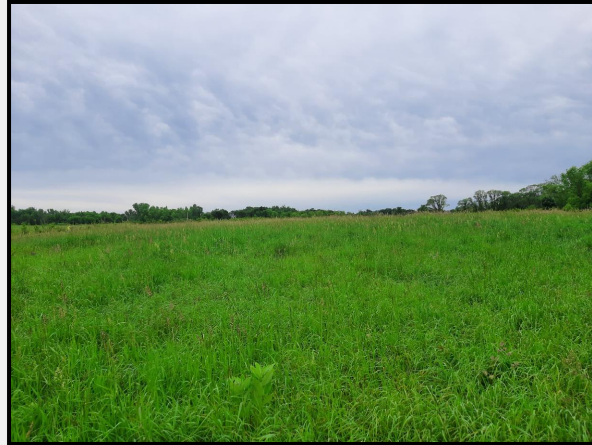
North west section – amended with wetland soils and reseeded 2021