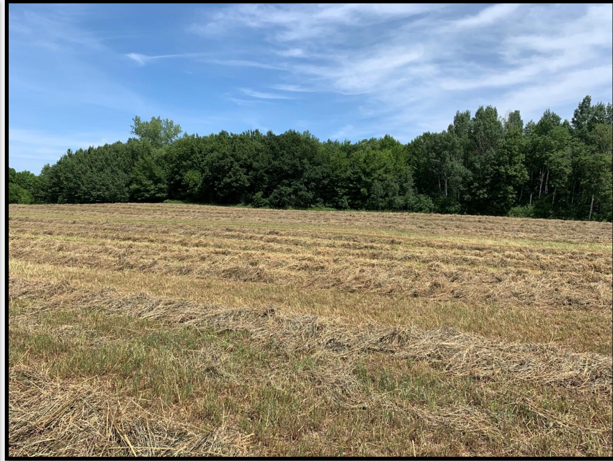
After 1 st cutting in 2023