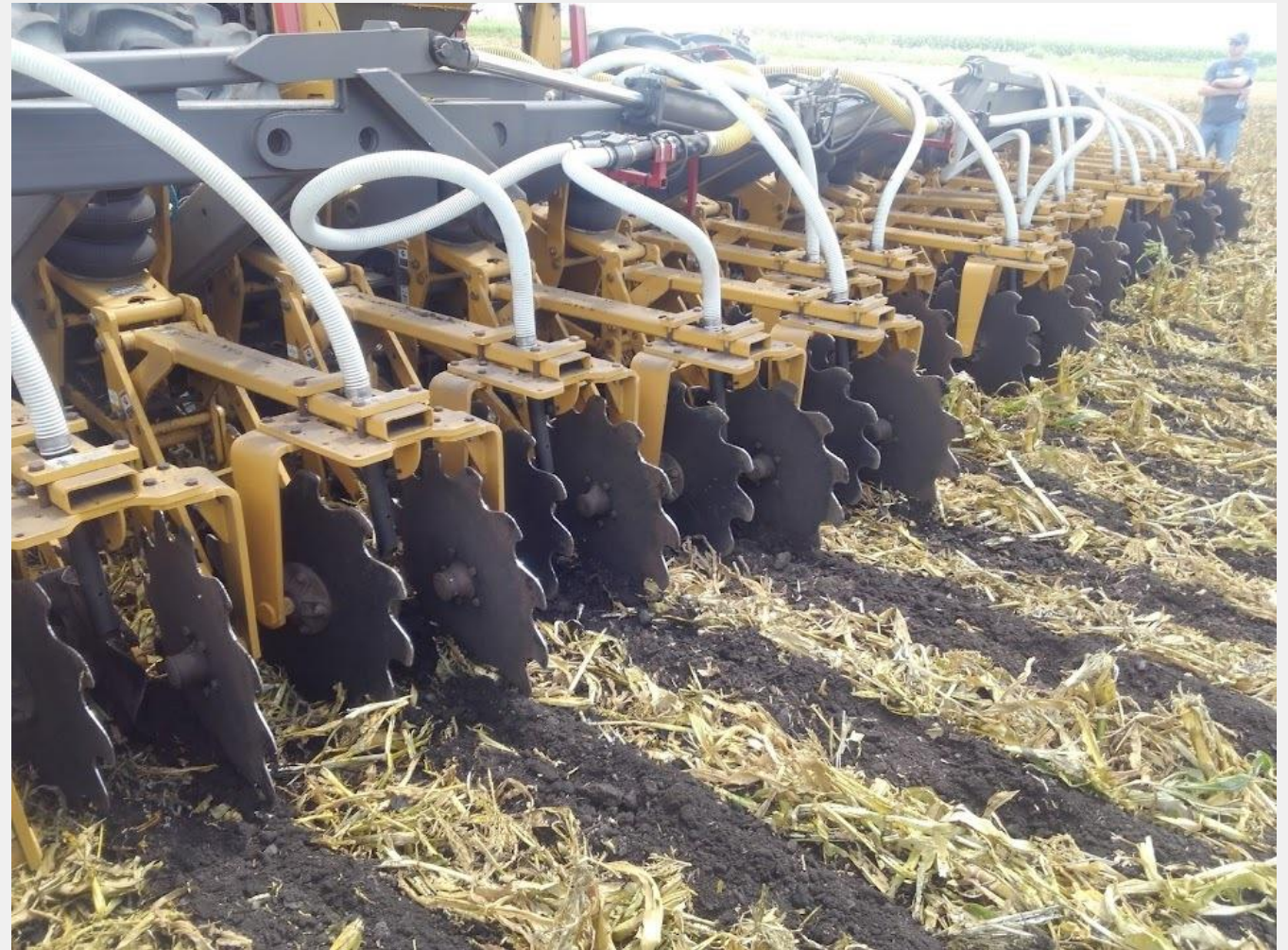
A strip-till machine demonstrated at a local field day