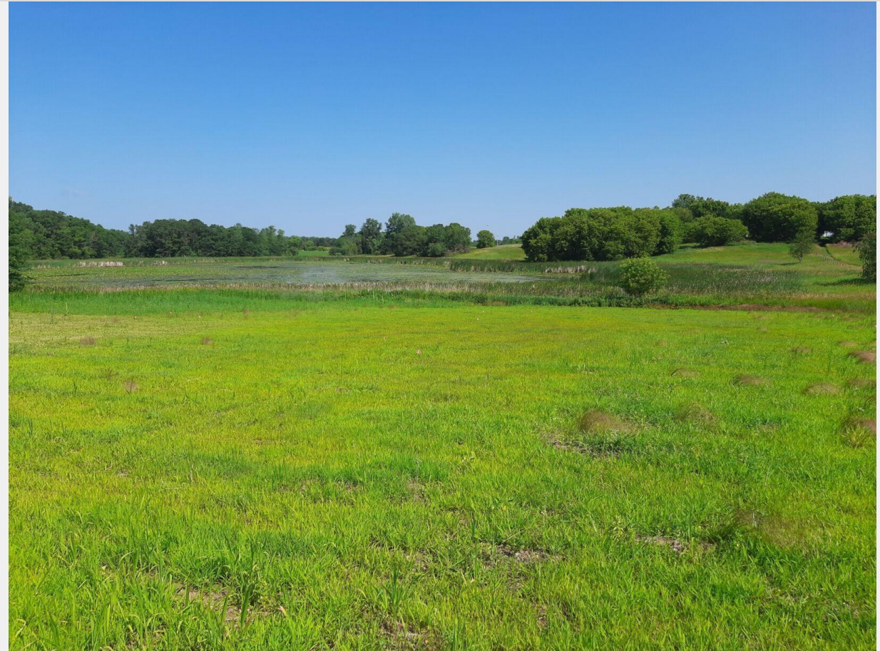
A wetland buffer put in place with technical and financial assistance. This prairie planting replaced row crops in an area of high groundwater sensitivity.