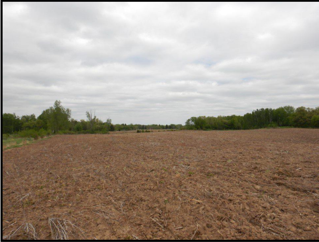
May 2020 – CLFLWD photo.