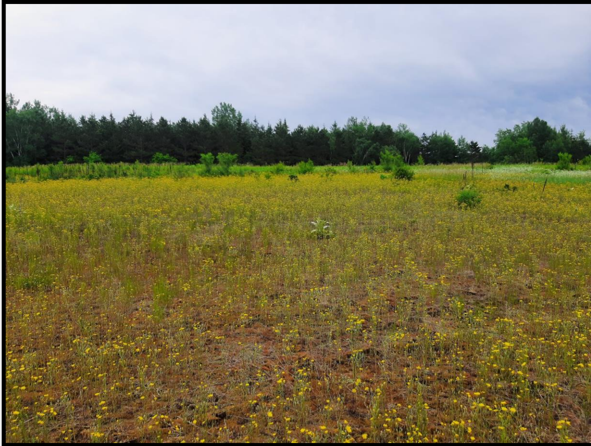
East side of field – amended with lime and seeded in 2017