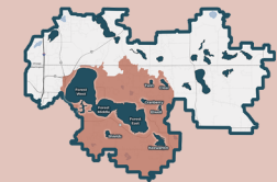
Forest Lake Management District