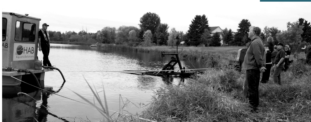
Photo: Alum applicator answers questions regarding the Moody Lake alum treatment and give visual tour of the application barge.

Events may be added or removed at the discretion of District Staff.