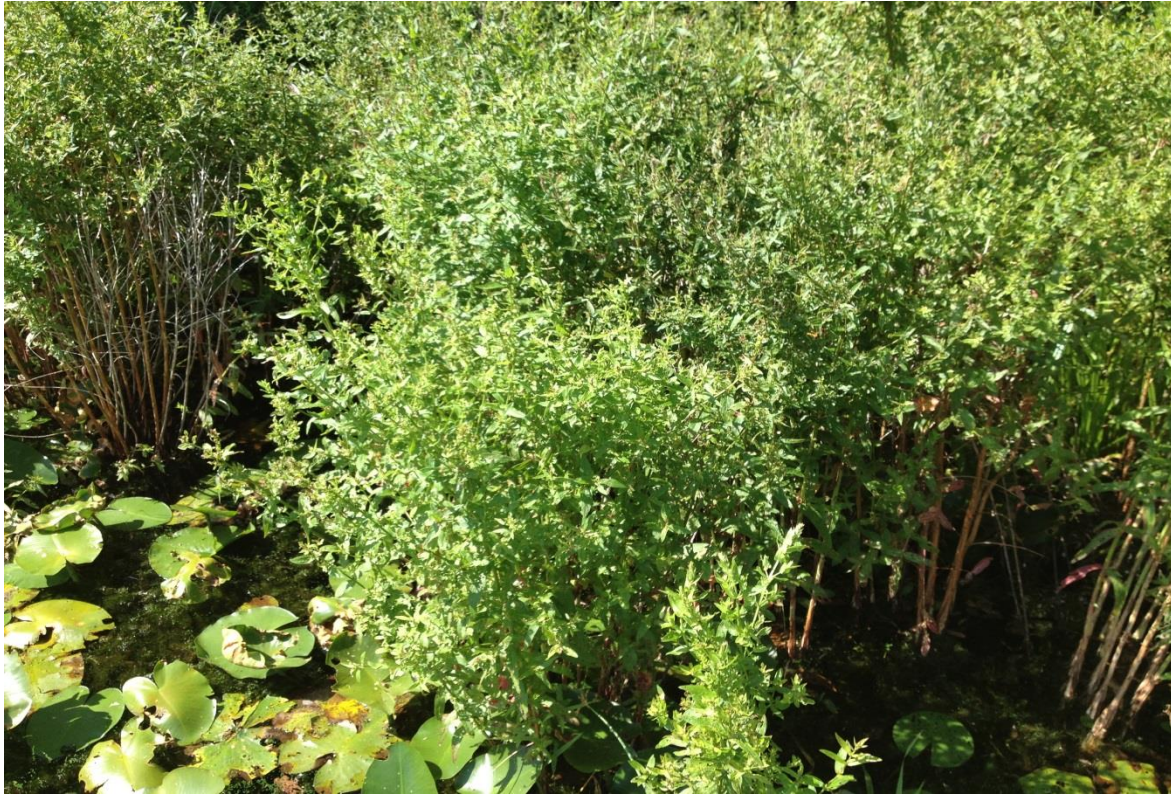
Figure 2. Purple loosestrife in Sylvan Lake, pre-bloom period.