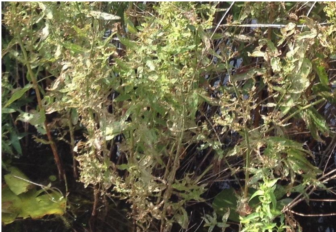
Figure 3. Defoliation of purple loosestrife (note the brown, curled leaves with holes).